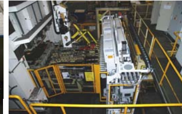
Integrated Cross Brusher at Ford