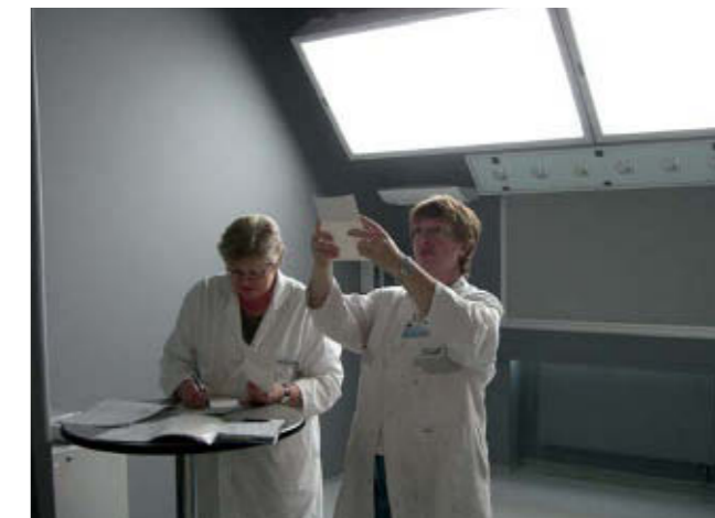
Light Laboratory, Merck KGaA, Gernsheim

A consequent adjustment of the lighting systems used for surface control can improve working conditions, save energy and lead to an easier detection of possible faults. Digital technology and intelligent controls allow for an optimization in both directions. For example, an active regulation of light power depending on vehicle and paint color offers an enormous savings potential. In combination with a digital control the brightness value of each incoming car body can be defined automatically with the help of sensors. As a consequence, a perfectly harmonized light is available for the inspection of each individual car color. In addition, the light power can also be dynamically changed according to lower capacity utilization, interval times etc. and be dimmed to a minimum. With the help of specialized surface control optics with combined prism and lense optics the test personnel can detect all errors glare-free even under conditions of high light intensity. Reflective tapes and light-dark contrasts projected onto the surface visualize even the smallest defects.