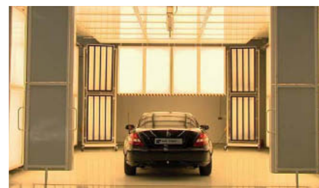
ColorMatching-Cabin, Mercedes Benz AG, Ludwigsfelde

face defects and as a reference for conventional audit illumination, as well as a shiftable Sunlight-System for the inspection of grinding and polishing errors.