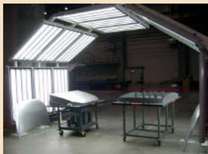
Gestamp Automocion, Kaluga: Audit for pressed parts inspection