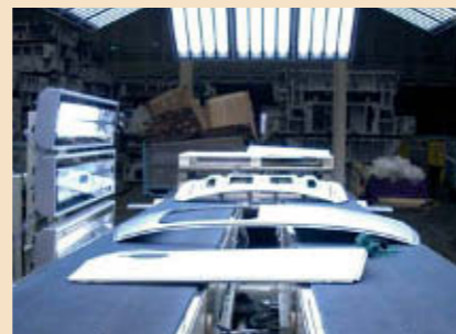
BMW AG, Dingolfing: Audit for pressed parts inspection

uwe braun GmbH. From visibility to perfection.