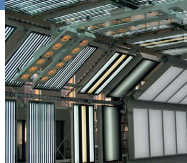
Lackier-Technikum VW AG, Wolfsburg

Eventually a multifunctional concept was realized which for the very first time combines and integrates five different light and surface inspection scenarios into one single light tunnel system: Wechsel-Linien-Optics (WLO) for the detection of body shell work and coating defects, Color-Control-Optics for the color matching of body shells and attached parts, Lack-Luster-Optics for the inspection of body shell errors on painted surfaces, LPS-100/58-Optics with daylight- and cool-white-color temperatures for the inspection of sur-