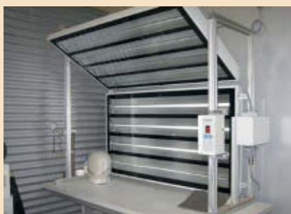
Schuberth GmbH, Magdeburg: Audit station for small parts inspection; in this case: motorcycle helmets

duction profile, the range of errors involved and the visual and control task to be handled Uwe Braun GmbH develops individual solutions for automotive suppliers as well as comprehensive system concepts for tandem OEM suppliers. Many companies are already successfully operating with this quality level to market their products to end customers as well.